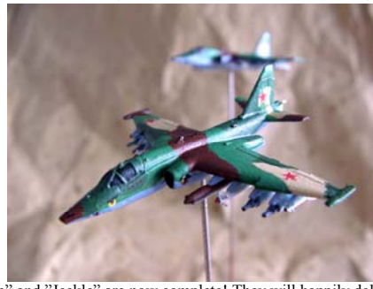
"Heckle" and "Jeckle" are now complete! They will happily deliver their load over the Mujahidin down there!