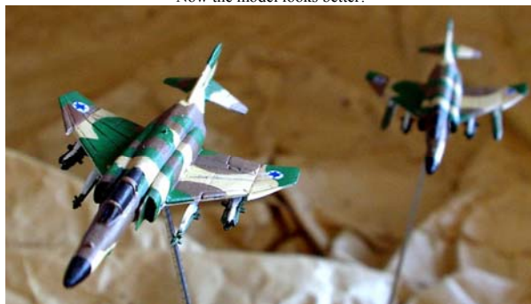
A pair of proud Kurnassim , ready to strike Syrians and Egyptians alike!