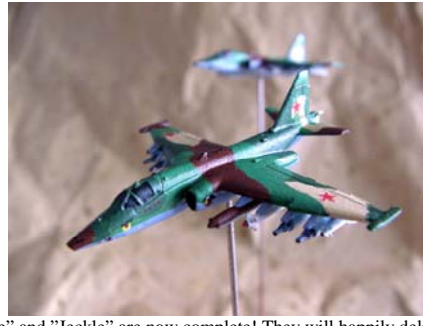
"Heckle" and "Jeckle" are now complete! They will happily deliver their load over the Mujahidin down there!