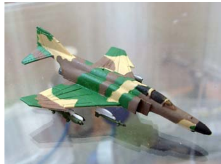
Now the model looks better!