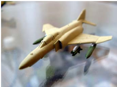
The nosy F-4E. The ordinance is already glued to the model

In order to paint the Israeli marking I drilled a hole in a paper and then glued the paper to a piece of tape. Over these equal-sized white circles I painted the blue stars of David. The outcome was not perfect but wasn't too bad either. Afterwards it came the squadron markings (I chose the 69 th ), the plane numbers and a thin red stripe and, for the final touch, the matt varnish. It was done.