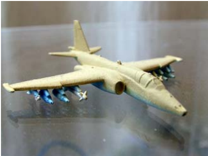
The Su-25 with base colour and grey-blue underneath

I was quite happy with the results, so happy that I actually bought one of the planes from its original owner!