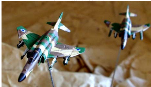
A pair of proud Kurnassim , ready to strike Syrians and Egyptians alike!