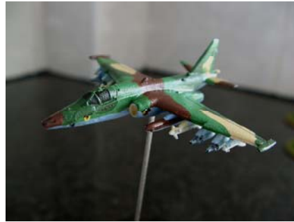
The model with glossy varnish and some nice markings