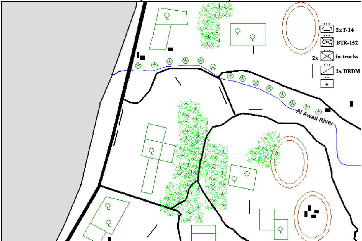
Area of Operations and Force's composition

Total: 44 Operational Points, withdraw at 40% casualties (17 OP)