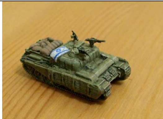
My Nakpadon, complete with highlights and weathering, proudly sporting a Star of David.