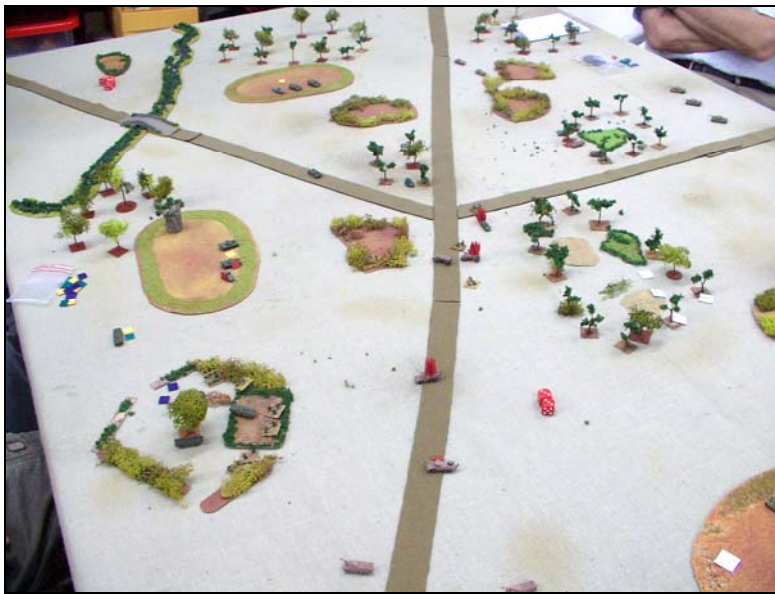
The table at the end of the match

second artillery barrage that hit both their armoured units with a devastating effect. Without armoured support and already suffering 60% casualties, the FAPLA commander decided for a retreat.