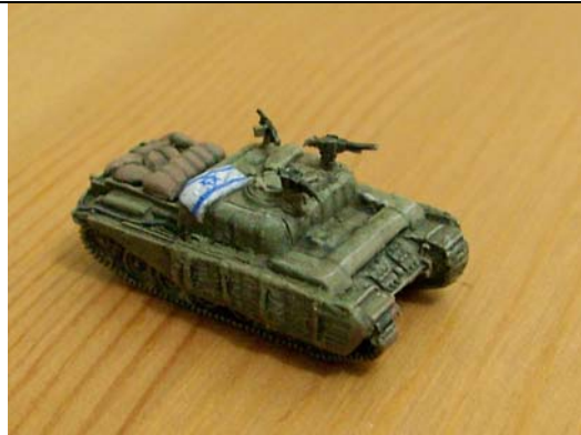
My Nakpadon, complete with highlights and weathering, proudly sporting a Star of David.