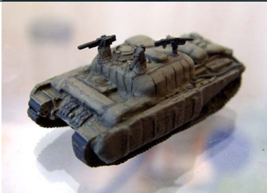
The vehicle with base colour and shades